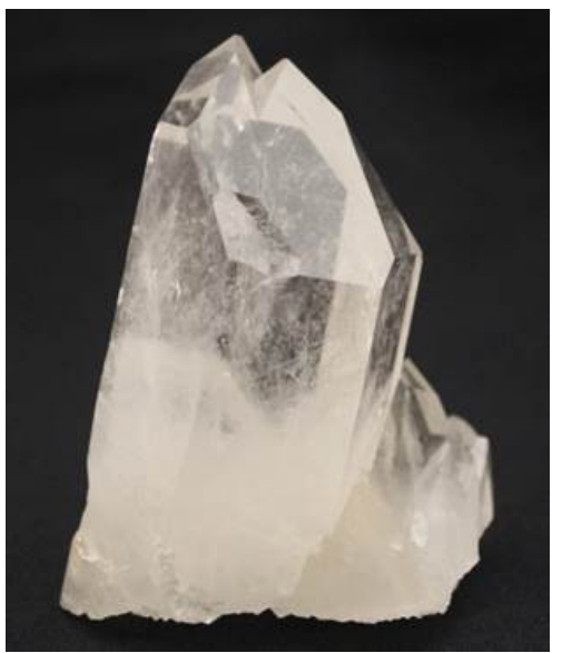
Arkansas Clear Rock Crystal, AKA Quartz Coming in May

The featured mineral in May will be the rock crystal variety of quartz from the classic locality in the Ouachita Mountains of Arkansas. These specimens consist of well-developed, lustrous, terminated, hexagonal prisms of colorless, almost water-clear quartz. Each crystal has a distinctive, hexagonal shape with six longitudinal faces and a six-sided, pyramidal termination.