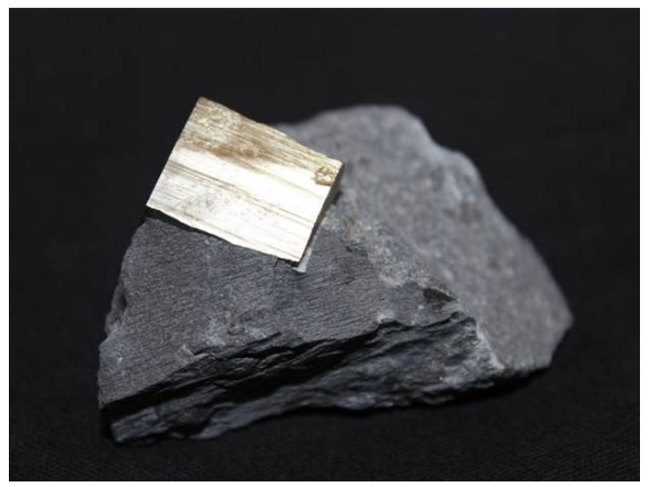
Pyrite in Phyllite